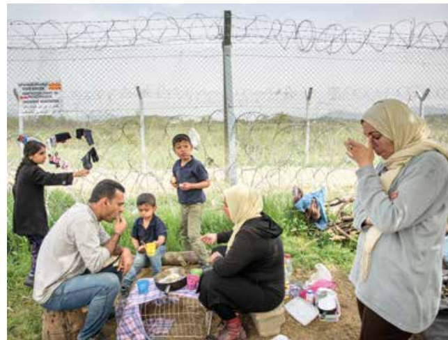
People in a refugee camp – facing an uncertain future

Even in the 21st century genocide and despotism are not a matter of the past. Every year millions of people continue to flee from war, persecution and terror all over the world.