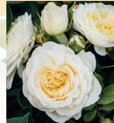
Friedenslicht® / Eirene® Tantau 2015

The full, nostalgic blossoms open changing from an initially warm, creamy-apricot to a brilliant white.